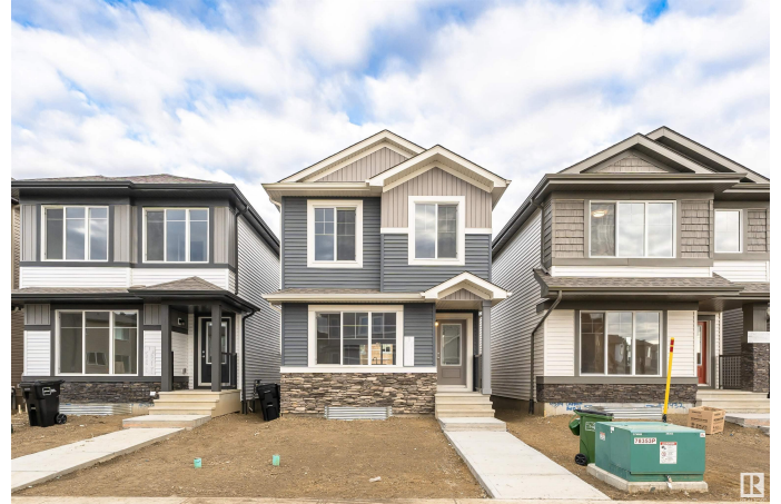
9566 Carson Bnd SW, Edmonton, AB

Main Floor Exterior Area 65.32 m 2 Interior Area 59.37 m 2