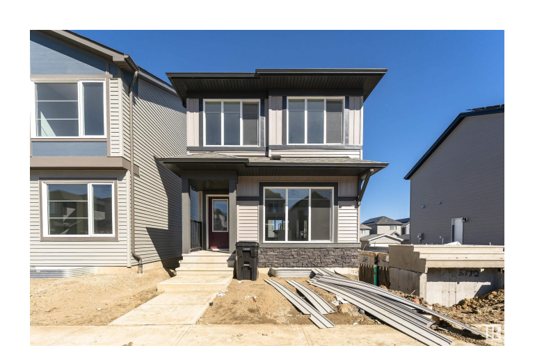
5134 Kinney Wy, Edmonton, Al Main Floor Exterior Area 680.67 sq ft