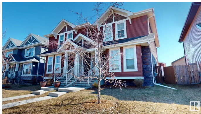
1083 Watt Promenade SW Edmonton